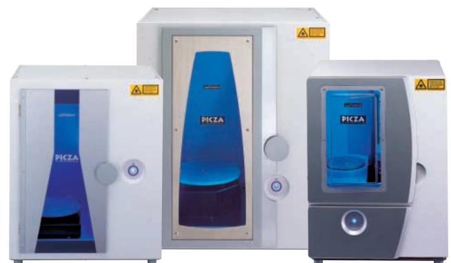
3D LASER SCANNER PICZA Model LPX-60 DS Compact and most affordable