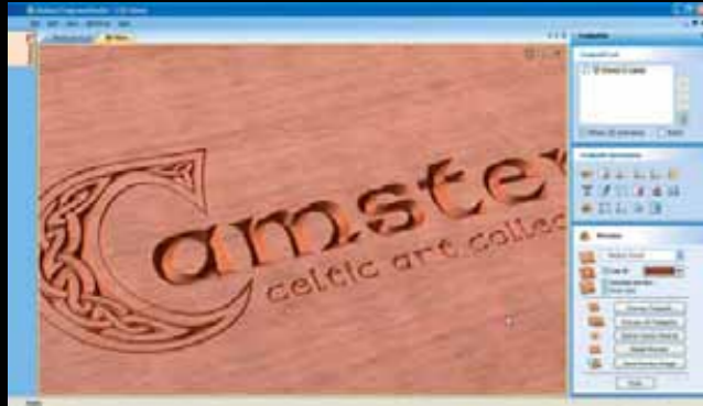
Full preview function helps make errors a thing of the past