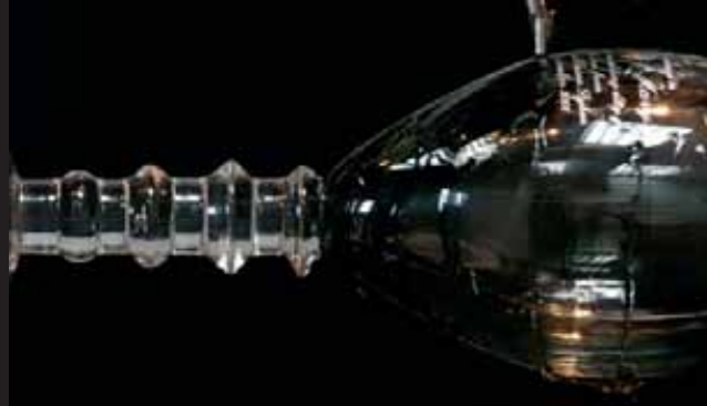
Safe and simple glass engraving with water coolant and dust removal