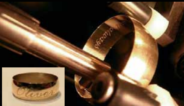
Engrave inside and outside rings