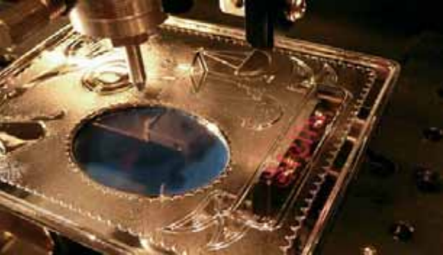
Laser enables quick sizing and positioning of engraving