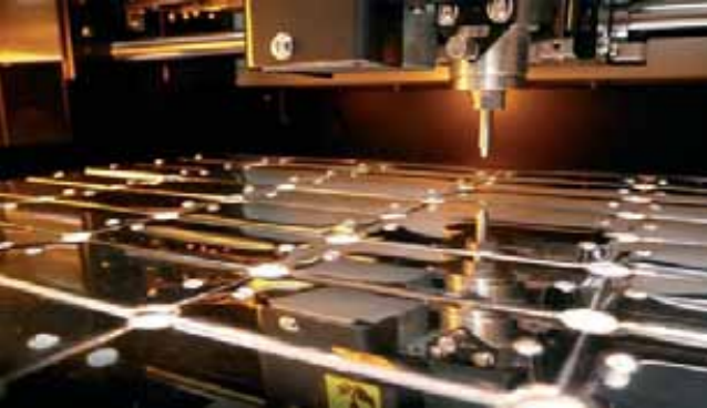
Included flat table ideal for larger plaques and batch production